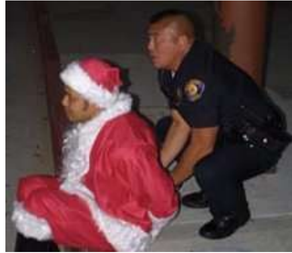
Songs and hymns for the family